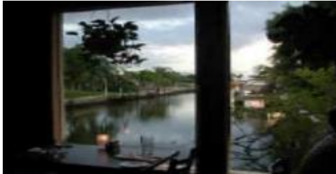
A view from Charley's Boat House Grill

It's worth a short drive or trolley ride (or one-mile walk) north to Charley's Boat House Grill . Over 55 items on their salad bar! Great place for steaks and ribs, as well as seafood.