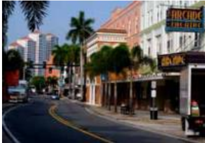
Historic Downtown Fort Myers

Drive a little farther north to visit the historic Fort Myers Downtown River District . You'll find interesting restaurants, art and craft galleries, and unique shops.