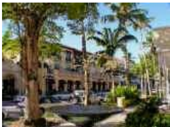
Old Town Naples

Old Town Naples is a fun place to shop and dine. We especially like Campiello's and Lurcat, both owned by an outstanding Minnesota restaurateur. Naples is about a 40 minute drive south.