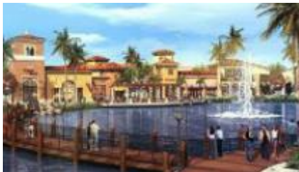
Coconut Point Shopping Center

The premier shopping center in the area is Coconut Point, which has scores of famous retail stores, excellent restaurants and movie theaters. It's about 30 minutes away in moderate traffic. Drive south through Bonita Springs, turn left onto Highway 41.