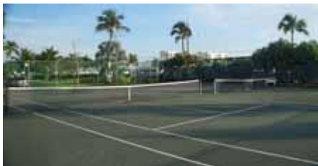
There are 4 Estero Beach and Tennis Club clay courts

If you are a tennis player, bring your rackets. Some of our guests especially love these tournament-quality clay tennis courts, which are available to you at no extra charge. (You'll have a security card for admission.)