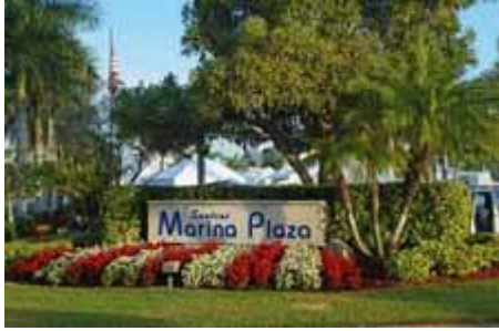
Santini's Marina Plaza